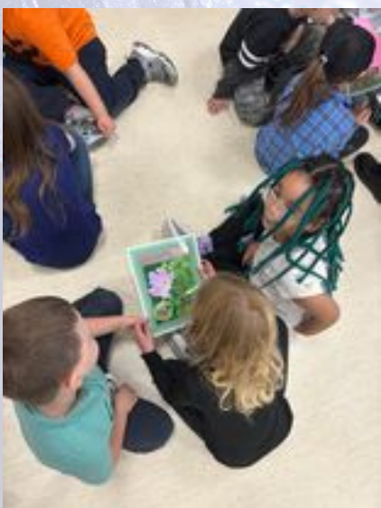
Traditional Plants @ MMH