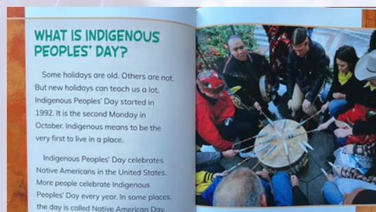
What is Indigenous Peoples Day? Read Aloud (USA)