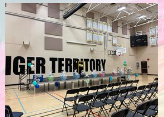
Indigenous Honour Night!