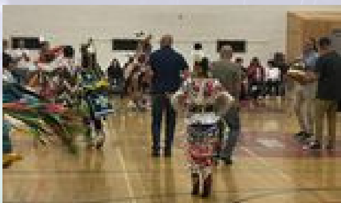
Kímmapiiyipitssin Festival @ Vic Park