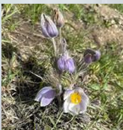
The Crocus have arrived!