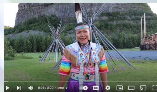
Learn how to dance Powwow