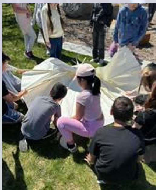
Tipi teachings @ Lakeview