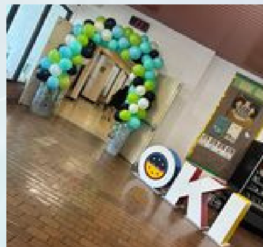
2024 Indigenous Grad