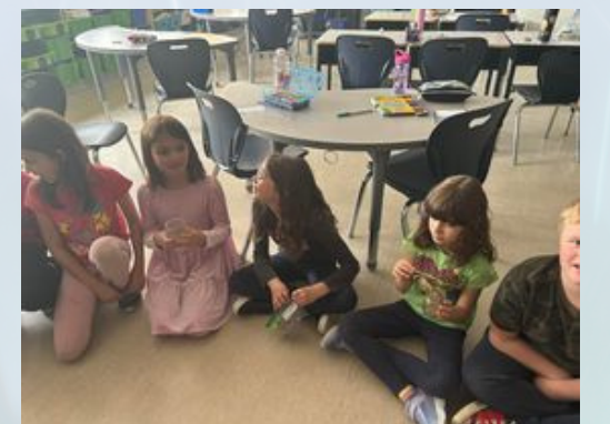
Traditional Plants @ Buchanan