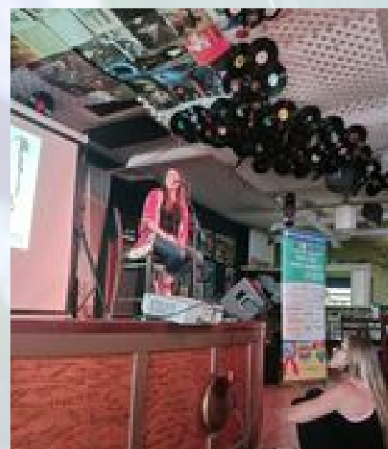
Moose Hide Campaign @ The Owl