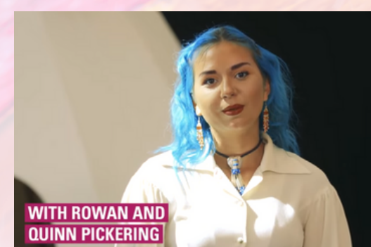
Learn to Jig!