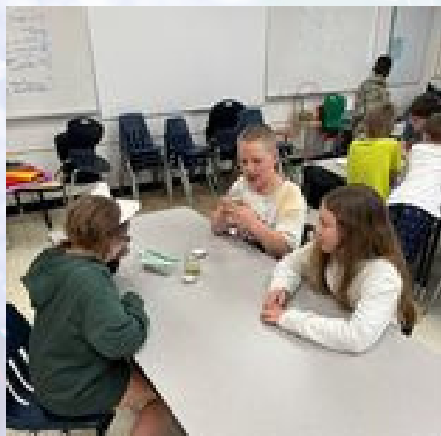
Traditional Plants @ Lakeview