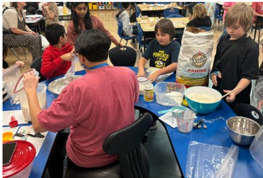
Made Bannock @ Fleetwood