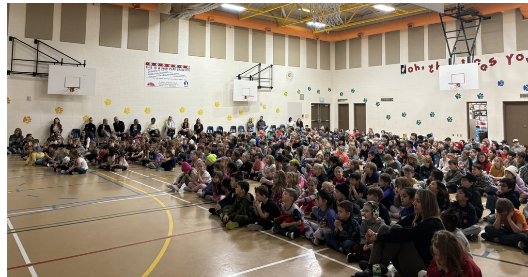
Learning about the Buffalo @ Probe