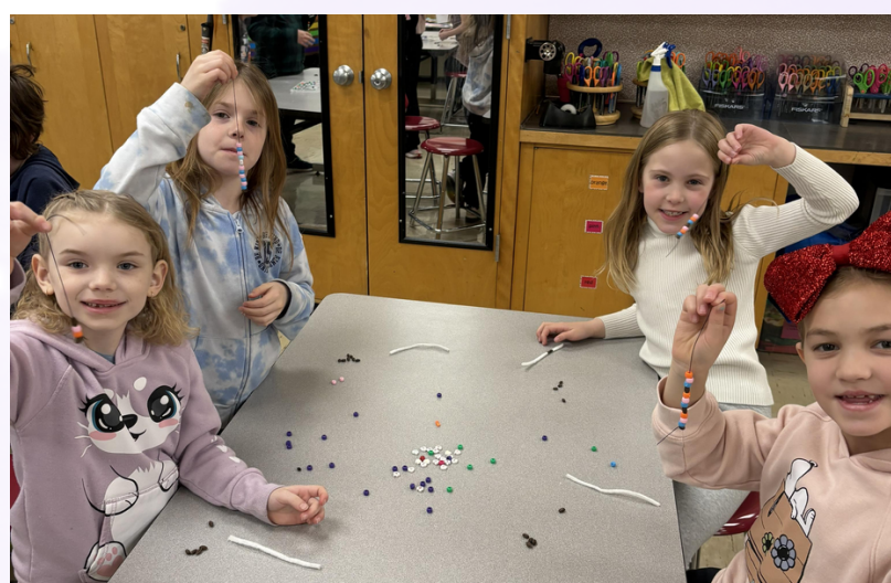
Wolf Willow Bracelets @ Agnes