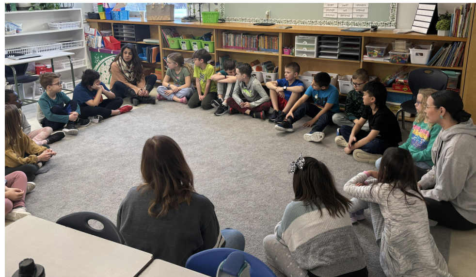
We got to attend a Sharing Circle @ Nicholas Sheran