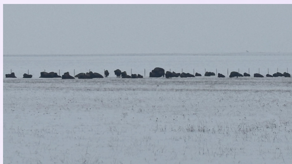
Learning about the Buffalo on the Blood Reserve