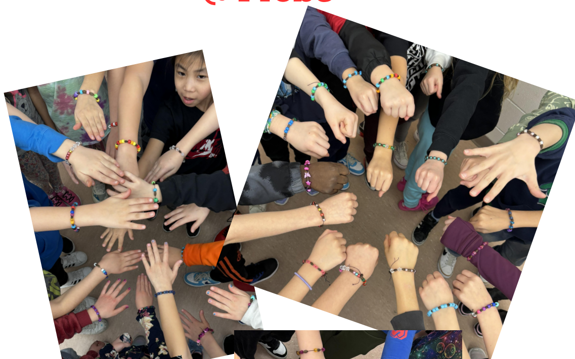
Wolf Willow bracelets @ Probe