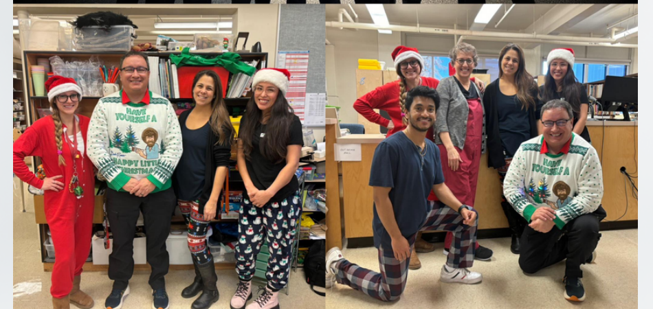
Holiday Wishes from the Indigenous Ed Team and the CRC