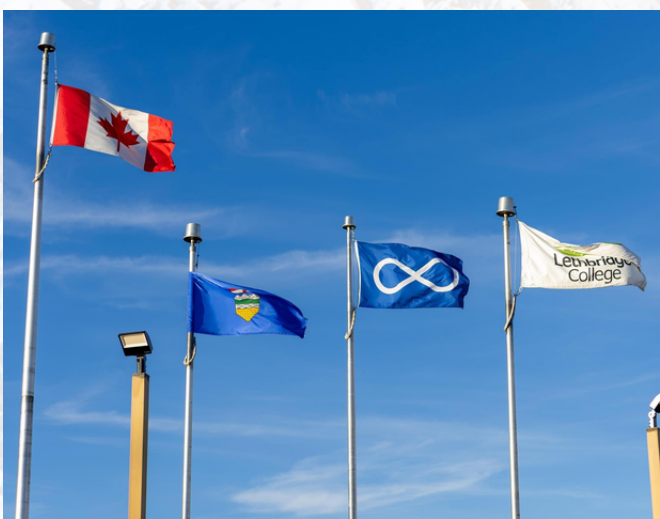
Metis flag raising at Lethbridge College