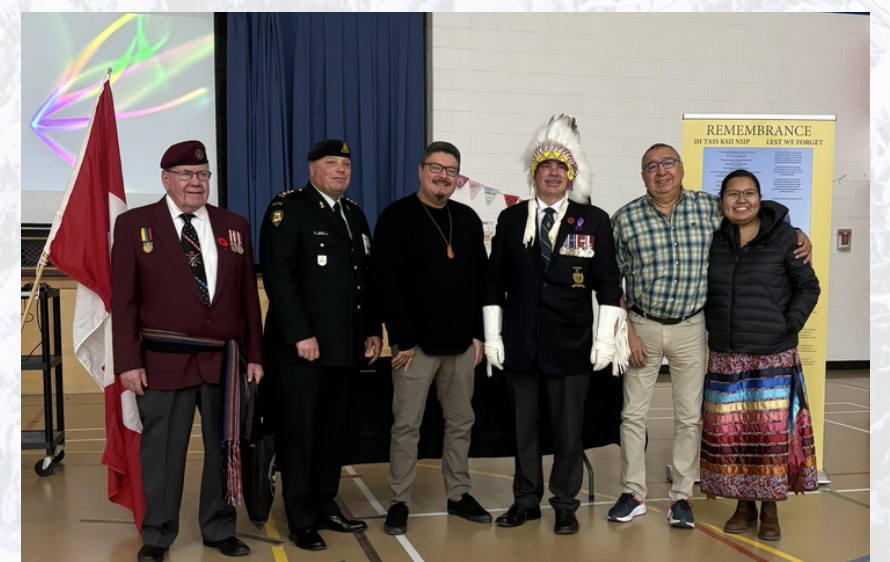
Indigenous Veterans Day @ Park Meadows