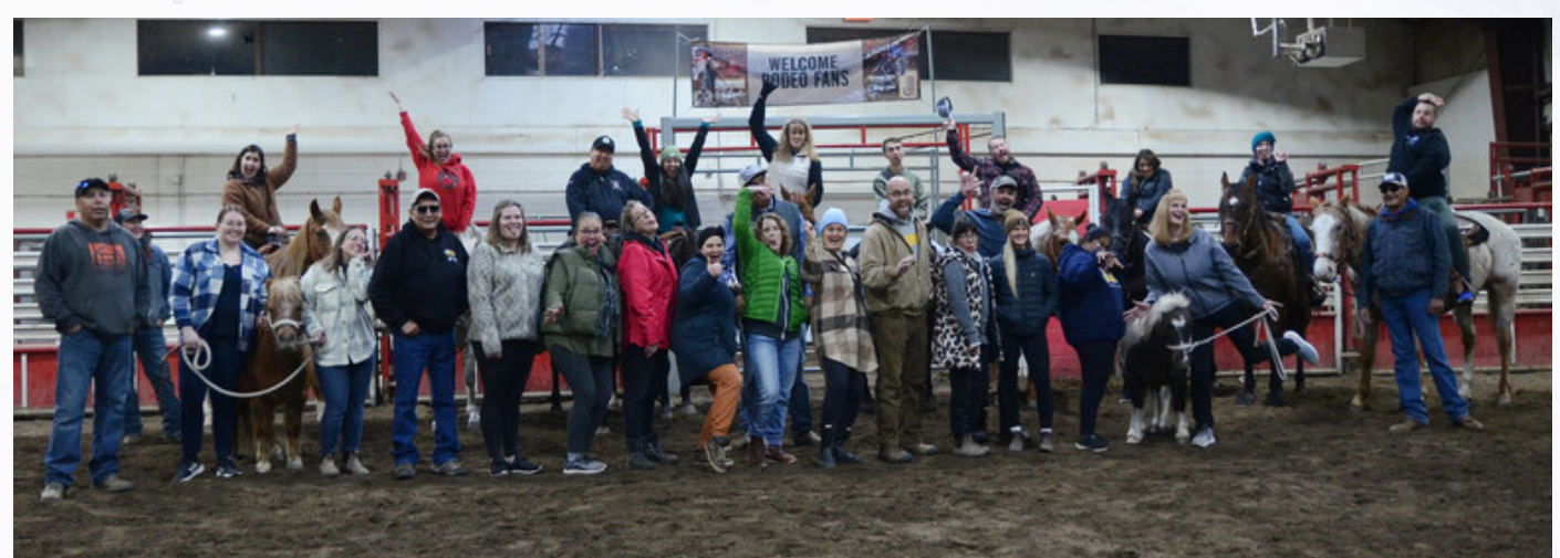
Indigenous Education Professional Learning!