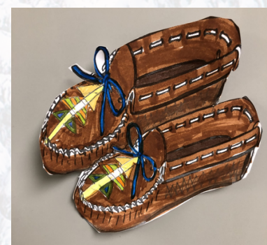
Rock your mocs @ Westminster