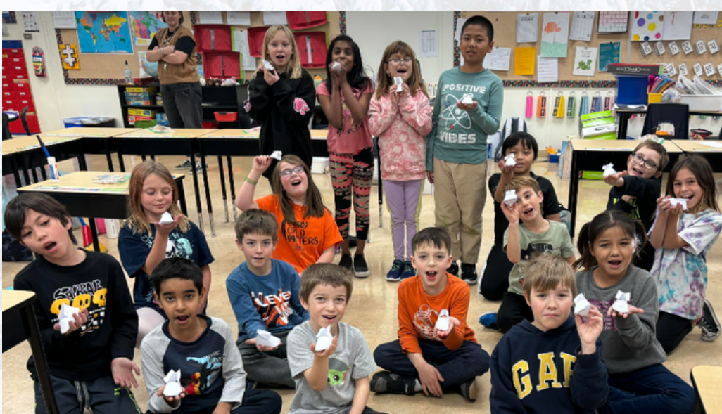
Rock your mocs @ Fleetwood