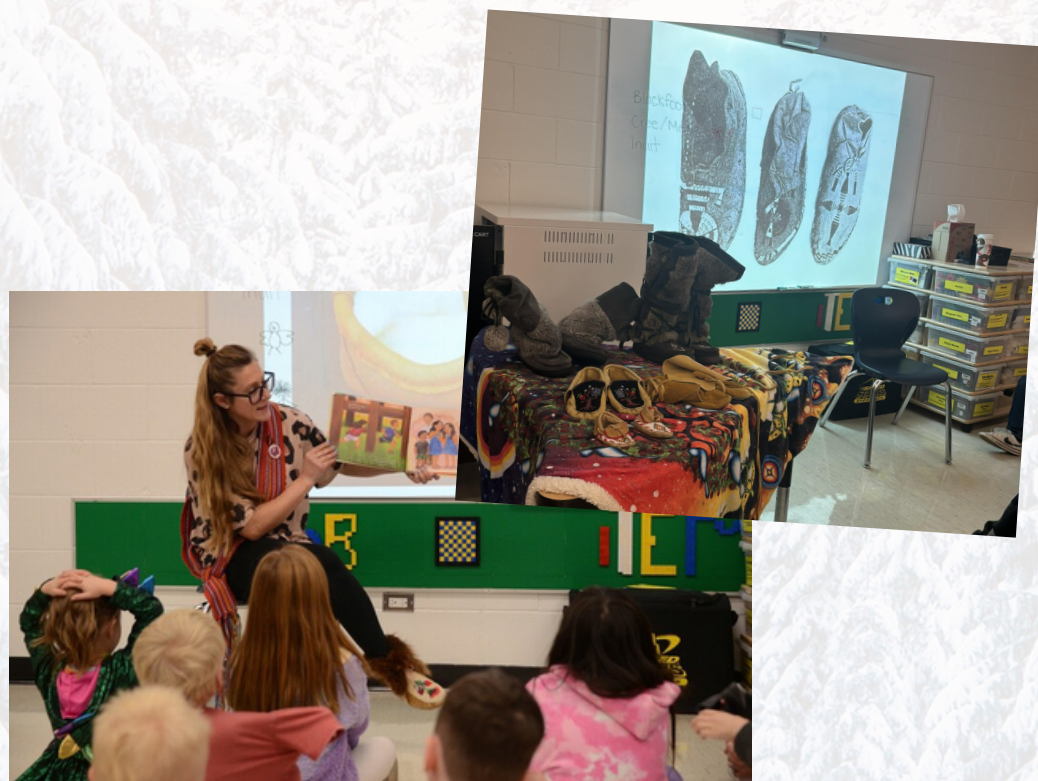
Rock your mocs @ Buchanan