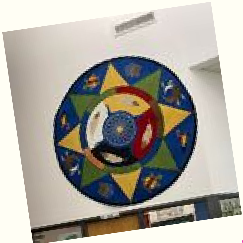
Beautiful new rug above the Park Meadows front office!